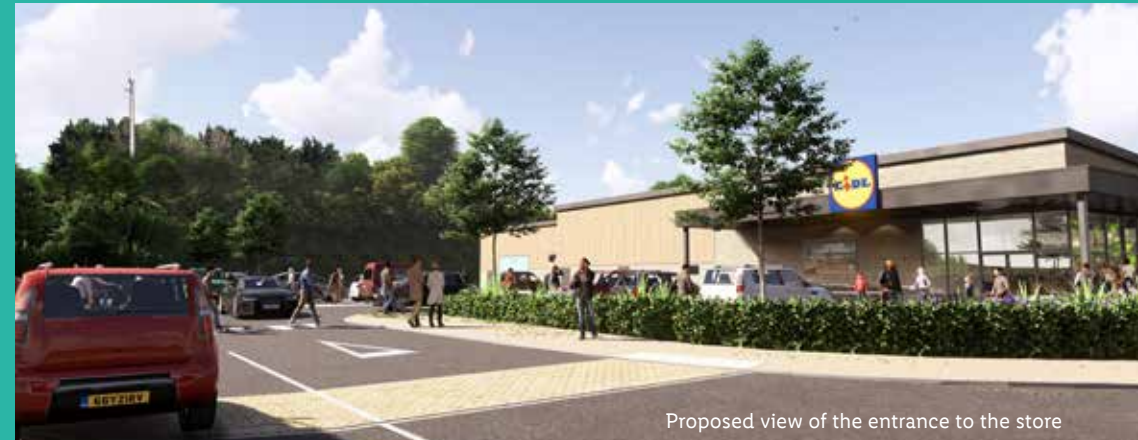
Proposed view of the entrance to the store

In November 2022, Lidl received planning permission to bring a new supermarket to Grove Road, serving Grove and Wantage. Lidl has now submitted a new planning application, to make minor amendments to their approved store.