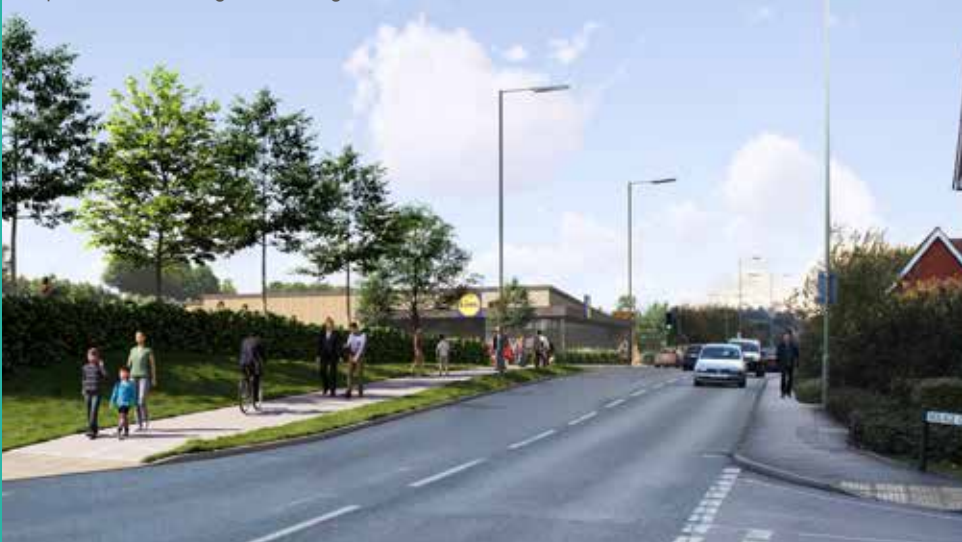
Proposed view looking south along Grove Road

From 1st March 2024, our starting wages will raise from £11.40 per hour to £12 per hour outside of the M25, rising to £13 with length of service. These new entry level rates will be up to 17% higher than the National Minimum Wage introduced in April. This represents an investment of £37 million, includes increases for salaried staff and will mean our 26,000 hourly-paid colleagues receive the highest rates of pay in the sector. We're also increasing our bank holiday and nightshift premiums. Lidl does not operate zero hour contracts.